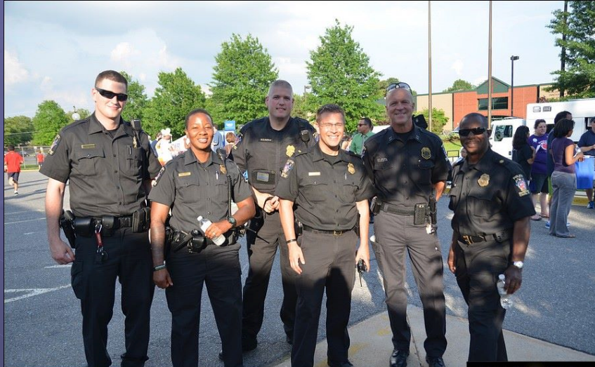
Autism Night Out Montgomery County Police Department