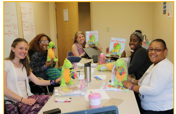
Child care providers at a training at CARD

In August of 2013, CARD received a grant from the U.S. Department of Health and Human Services Health Resources and Services Administration (HRSA). This grant has supported a randomized control trial designed to teach child care providers strategies to support children's learning and engagement in the context of routine activities within the child care curriculum. Providers allocated to the treatment condition receive two professional development workshops plus weekly coaching for a 5-6 month period, with a focus on using specific instructional strategies in their classrooms. Providers allocated to the "business as usual" condition were followed for 5-6 months, and then received the two professional development workshops only (no coaching in their classrooms).